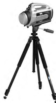
Tripod Mount for Radiation Screening