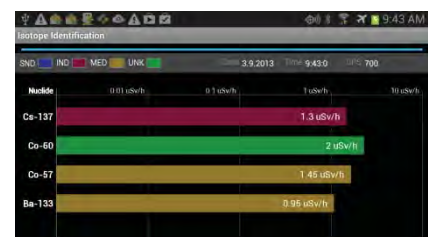
Color Coded Isotope Class and Details