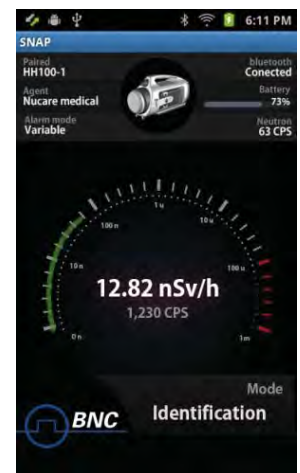
Display Indicators (BKG, Library, Mode, Alarm State)