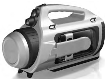
Display Closed for Transport, Unmanned Monitoring