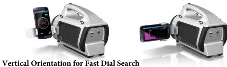
Vertical Orientation for Fast Dial Search

For the next generation of Isotope Identifier users, the SAM III should be considered.